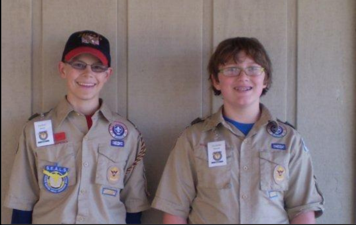
S.E.A.L.S. 2012 Graduates

You get put into a patrol with no one from your Troop and you have to be with them for two days. Your Troop